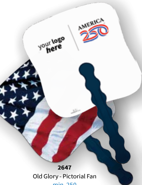
2647 Old Glory - Pictorial Fan min. 250