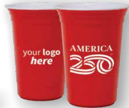
FC16 Varsity Double-Wall Cup with Liner - 16 oz. min. 250