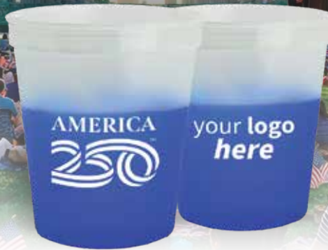
SC16CC Color-Changing Stadium Cup - 16 oz. min. 250