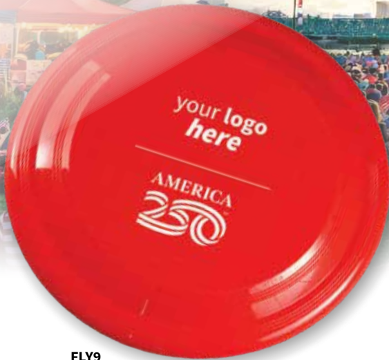
FLY9 9" Flyer min. 200

Celebrate 250 years of American innovation