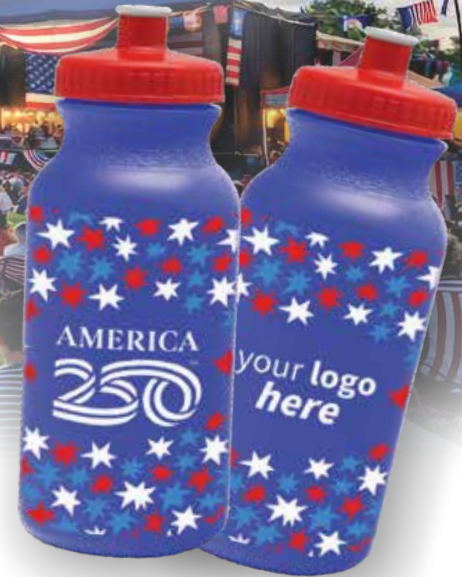
WB20C Bike Bottle (Colors) - 20 oz. min. 200

Co-branding is as easy as red, white & blue: